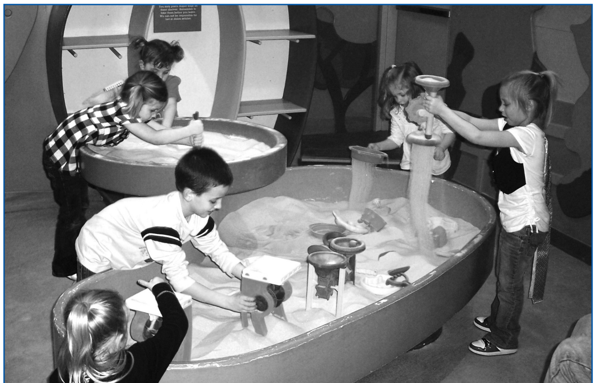
A big pile of sand, a few funnels, and lots of imagination make for big fun for Head Start students at the CMC Children’s Museum.

Everyone had a wonderful time. The event could not have happened without teamwork from all Head Start components, the Cincinnati Museum Center, and PNC Bank. NKCAC Head Start looks forward to another Night at the Museum next spring.